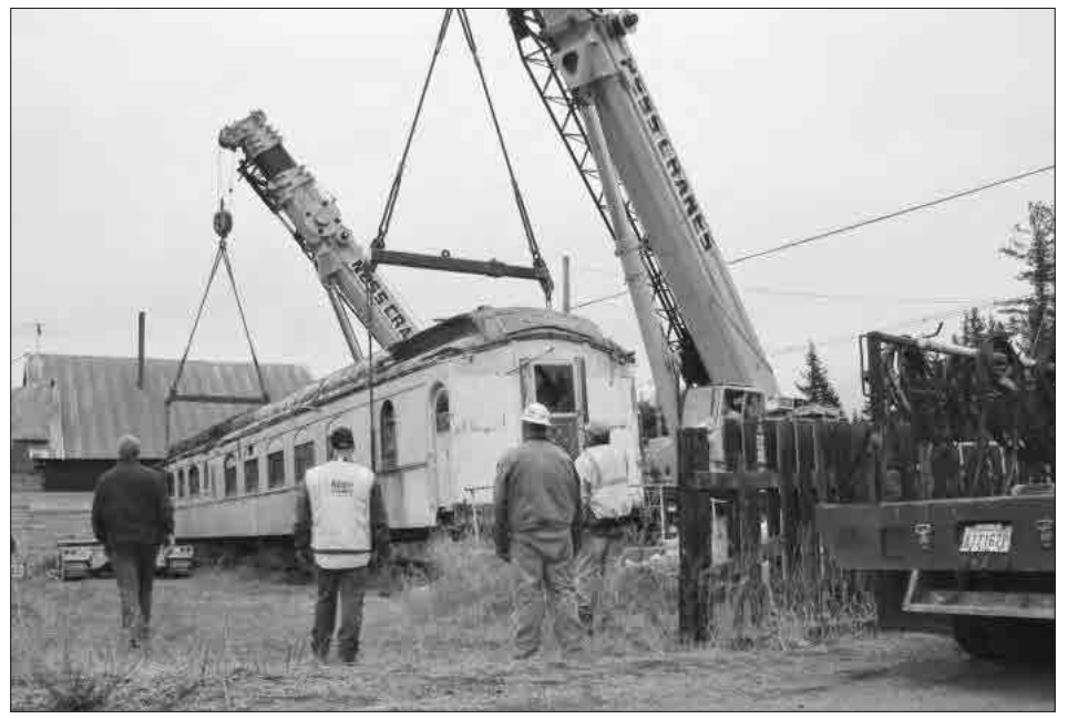
Cranes and crew work to lift and move the historic dining car.