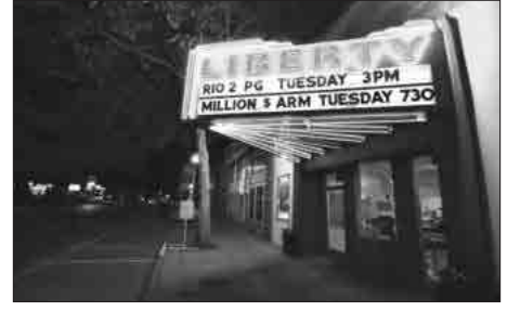
The Liberty Theater in downtown Dayton.

The DDTF's vision is to work together with public and private entities throughout the community to improve the historical, financial, commercial, recreational, and cultural aspects of Dayton. The Task Force is committed to building a healthier economy, improving stakeholder value, promoting an aesthetic environment, and encouraging a truly sustainable community that continues to represent the exceptional quality of life that their residents embrace.