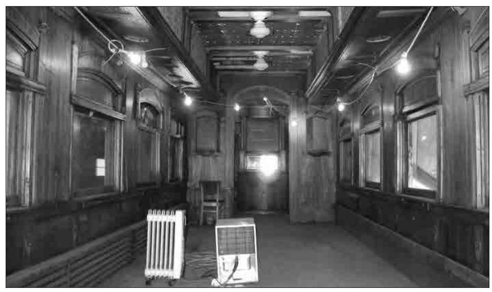
The historic rail car was kept heated to prevent mold from deteriorating the interior.

With a background in construction, he was well aware that the costs associated in moving a large structure over 100 years old would not be cheap. Without a known destination, Burns began getting cost estimates from contractors based on moving it 10 to