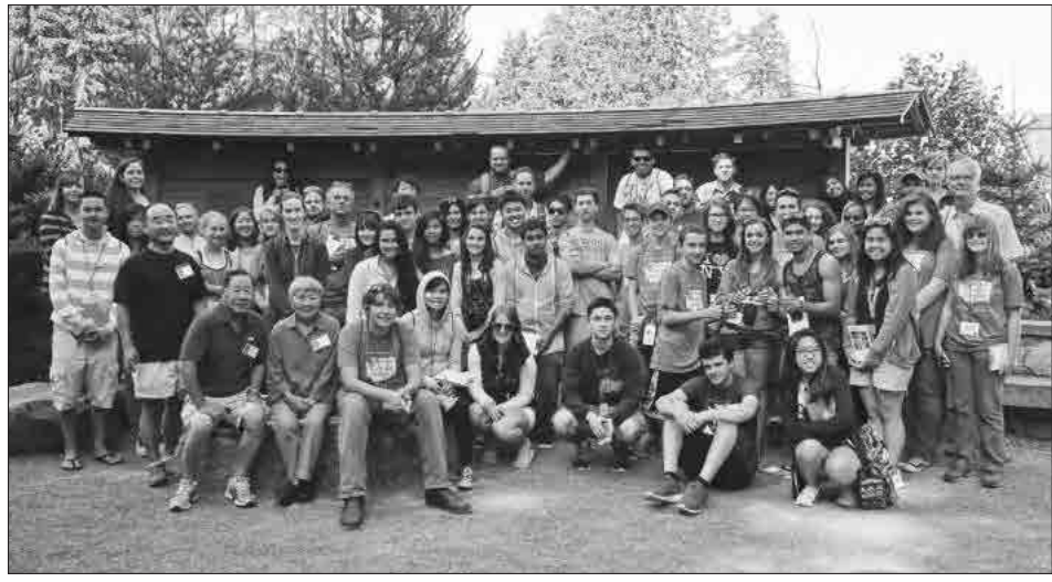
YHP group shot at the Bainbridge Island Japanese American Exclusion Memorial.

With the themes of memorialization and representation in mind, we explored a variety of sites on Bainbridge Island (BI). The Strawberry Plant Park, where a large plant once stood, is now empty and compelled students to think critically about how this site should be remembered today. Students also visited Bainbridge Gardens, a long-standing farming operation and a legacy Japanese family business with