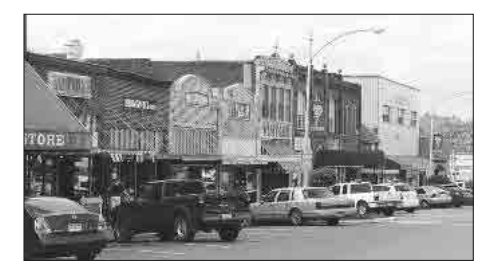
Historic downtown Chehalis.

The CCRT has created a solid foundation of support within their community. Since its inception, this group has seen tremendous growth and developed a reputation for successful projects, enthusiasm, and perseverance. With this groundwork in place, the CCRT is ready to move forward, soliciting the resources available from the Main Street Program and other communities within the network.