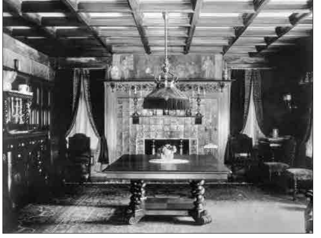
Stimson-Green Mansion dining room c. 1901.

Grant funding remained to also clean and restore the plaster relief sculptures in the ceiling cove of the reception room (also referred to as the ladies' parlor). Designed in the Empire Style of Napoleonic Paris, this room's primary feature is the ceiling's delicate plaster frieze of classical female figures alternating with swans, a symbol of Napoleon's Empress Josephine. Over the course of nine days in August, accumulated surface dirt, dust, and cobwebs were removed from the plaster relief sculptures. We are grateful for the generous grant support provided by 4Culture through Lodging Tax revenues collected in King County.