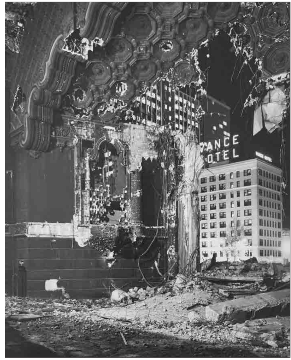
Fox Theatre (aka the Music Hall), the rehabilitation of King Street Station, and the ongoing redevelopment of the UW campus. He has provided our state with countless succinct and priceless historic images through his building documentation.

HAER (Historic American Building Survey/Historic American Engineering Register) standards. Over 350 of his HABS/HAER photos are held by the Library of Congress, including documentation of Washington State sites such as the Tacoma Japanese Language School, the Snoqualmie Falls Generating Station, and Sunrise Lodge at Mount Rainier National Park. He also created a comprehensive photographic record of Seattle's constantly changing built environment, including the demolition of the