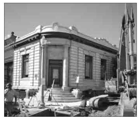
A bank building in downtown Waterville, currently vacant, is seeking a new owner and new possibilities!

The Waterville Main Street Association was organized for the purpose of developing, revitalizing and promoting this historic town. With a mission to, "encourage economic vitality and preservation of our historic downtown district while maintaining our small town quality of life," the Waterville Main Street Association is poised to energize this wonderfully intact historic district.