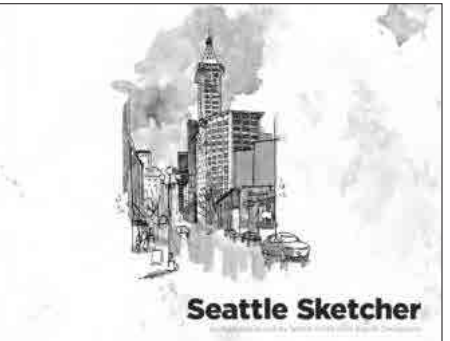
Seattle Sketcher: An illustrated journal by Seattle Times artist Gabriel Campanario, published by The Seattle Times, 2014.