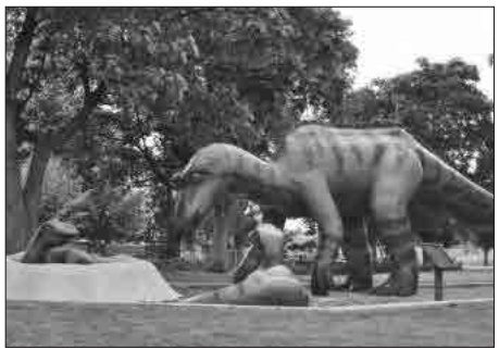
Dinosaurs in Granger!