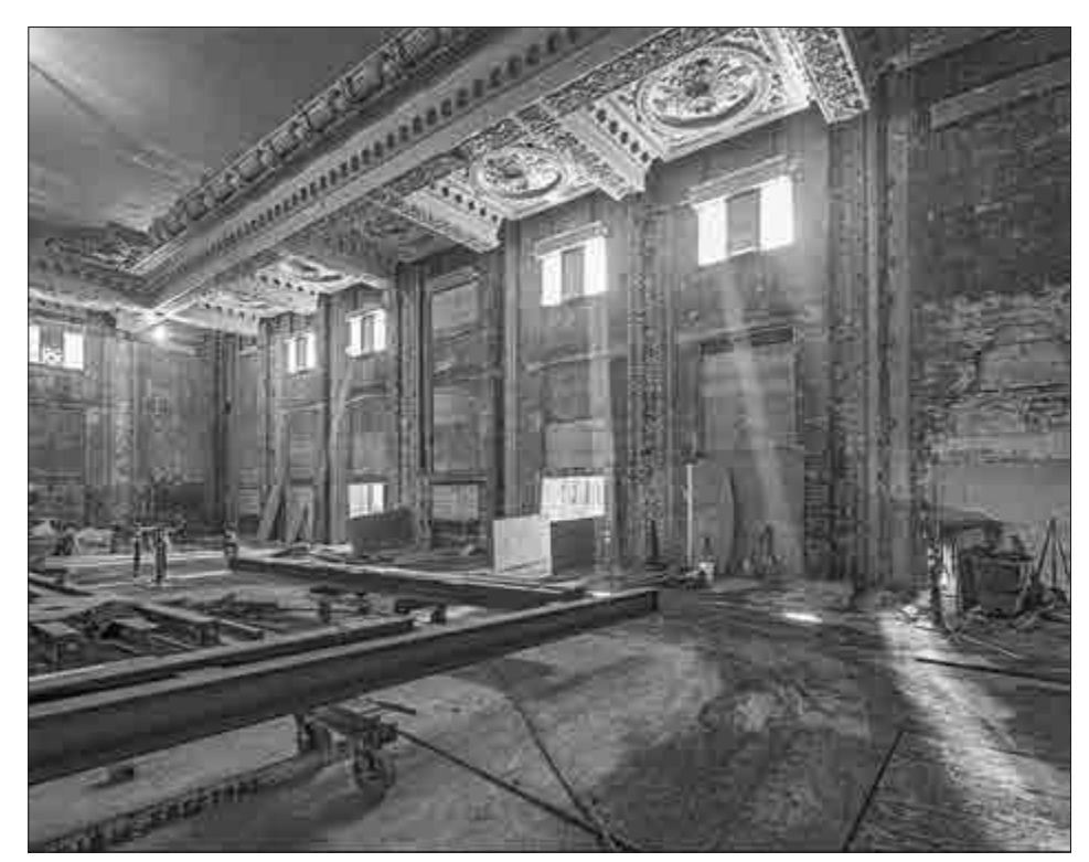
A view of the south wall of the King Street Station main lobby during renovation in the summer of 2012; historic columns are prepped for reinforcement with new steel. John extensively documented the entire King Street Station renovation (including the grand reopening event), and photos are available to view through the Seattle Department of Transportation's Flickr account.

Archiving – For long-term storage and archival preservation of images (100+ years), silver film is still regarded as the preferred medium because its properties are well understood, and it is easily managed. Archives of virtual images are much more difficult to maintain because the technologies that contain the images need to