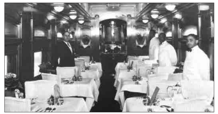
Interior of the 1910 Northern Pacific dining car in 1921.

15 miles; his estimates were coming in at $20,000 to $25,000.